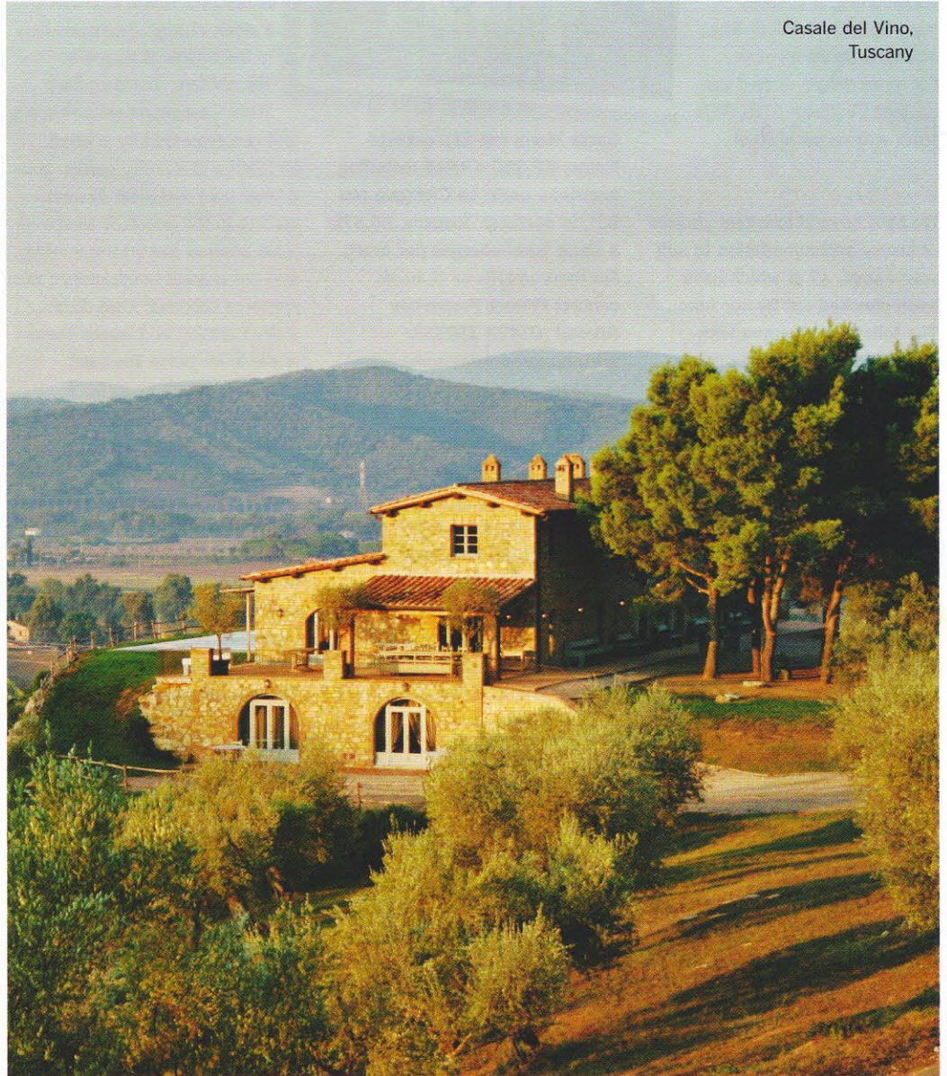
Casale del Vino, Tuscany